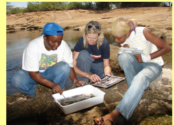
Environmental scientists looking at aquatic life as part of an Environmental Impact Assessment (IUCN)

One picture says more than a thousand words. We can make that picture that says it all.