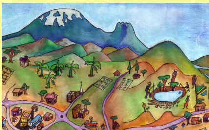
A section of a 3-dimensional map on environmental issues in the Pangani River Basin.

Visit us on the Web: www.kiliweb.com/ungano